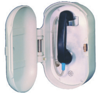
227-003 Tough Phone