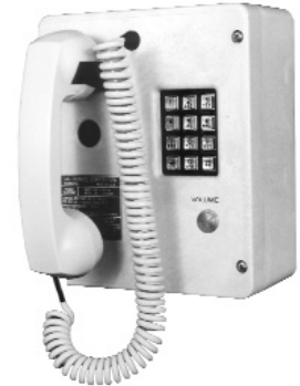
246-003 Indoor Phone