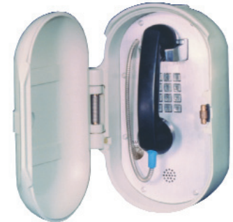
226-003 Tough Phone

GAI-Tronics ® S.M.A.R.T. indoor and outdoor Industrial telephones are designed for those applications where standard telephones are not environmentally suitable. Reliable, dependable communications is a vital and growing concern in all public areas including, subways, airports, industrial facilities, plant entrances, amusement parks, college campuses, parking garages and more. GAI-Tronics ® industrial telephones address this need and are built to endure extreme temperature ranges, vandalism, and abuse.