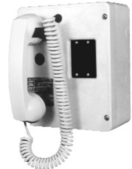
247-001 Indoor Phone