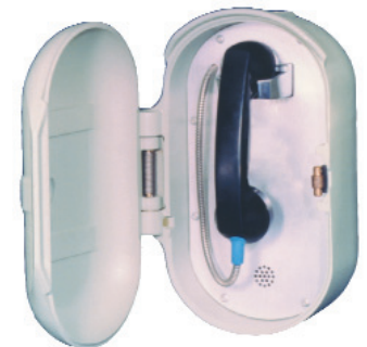
277-001 Tough Phone

GAI-Tronics® wide variety of indoor and outdoor Industrial Telephones are designed for those applications where standard telephones are not environmentally suitable. Such applications include public areas, plant entrances, college campuses, airports, commercial locations, parking garages and amusement parks.